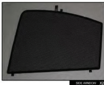
SIDE WINDOW X2