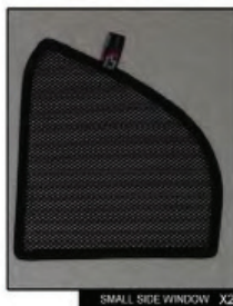
SMALL SIDE WINDOW X2