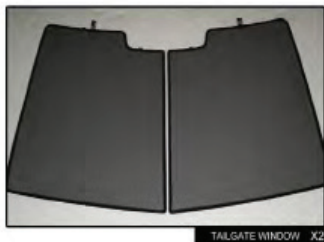
TAILGATE WINDOW X2